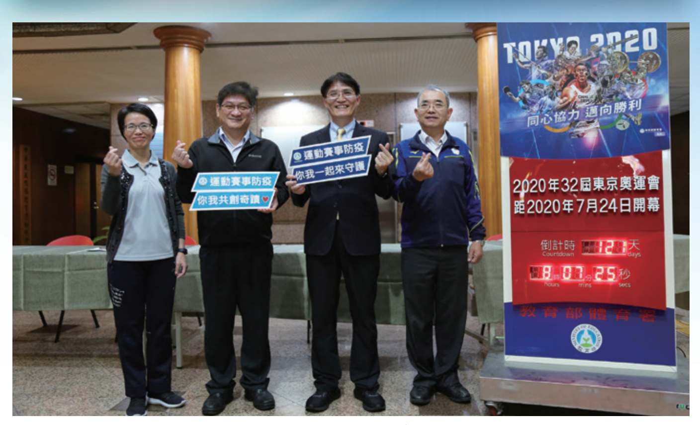
Sports Administration Director General Kao Chin-hsung (2<sup>nd</sup> from right) explains that although the 2020 Tokyo Olympics has been postponed preparations will continue unabated

Although the 2020 Tokyo Olympics has Been Postponed Preparations Will Continue Unabated