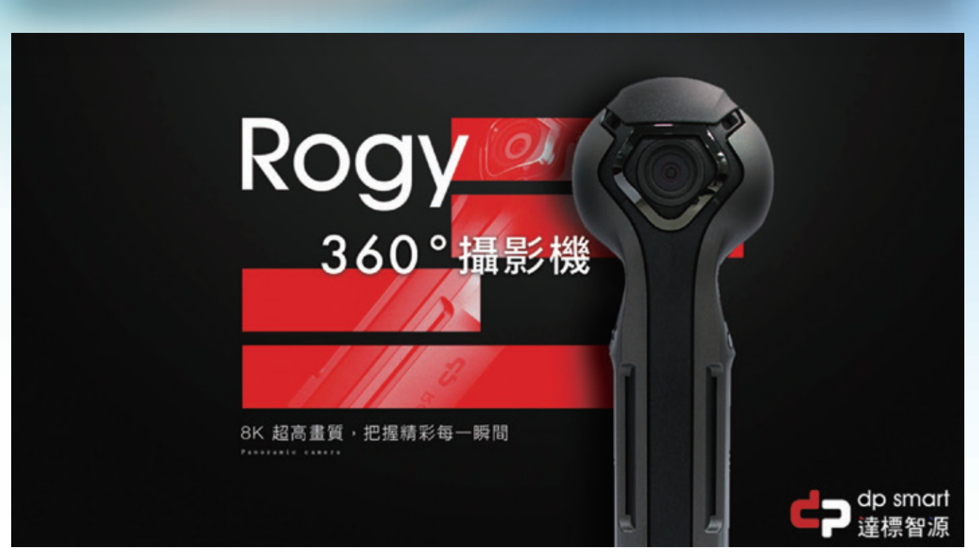
Taiwan-developed, designed and manufactured 3-in-1 panoramic camera that can take 360-degree 8K panoramic photographs, 4K panoramic photographs and livestream.

Asia's First Sports Startup Accelerator Offers More Innovative Products and Services to the World