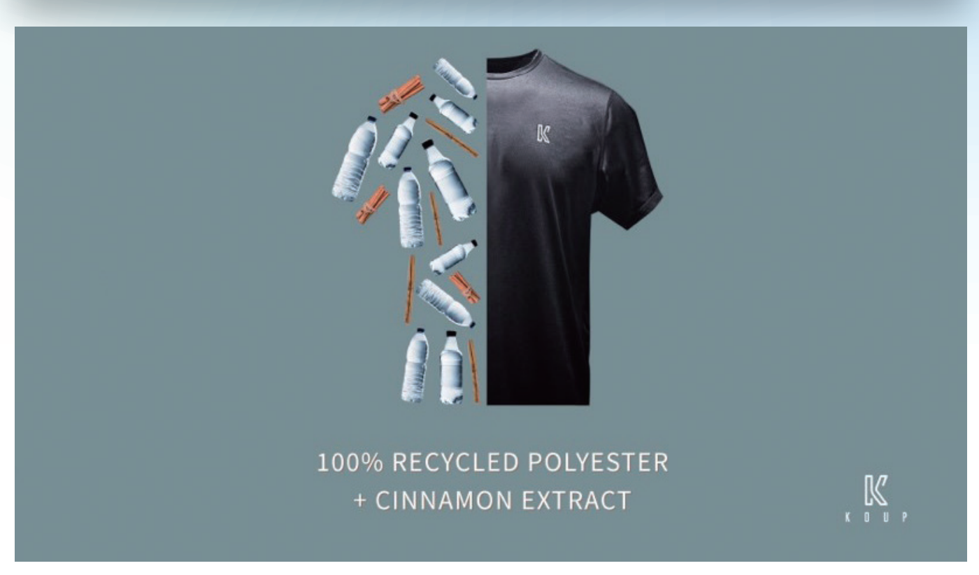
An item of clothing made from cinnamon and PET bottles

The HYPE SPIN Accelerator TAIWAN program is a joint effort of the Sports Administration and National Chiao Tung University's IAPS and Israel's HYPE Sports Innovation (HYPE). Starting from October 2018, four training cycles have been held; the fourth 3-month intensive training cycle began in May, 2020.