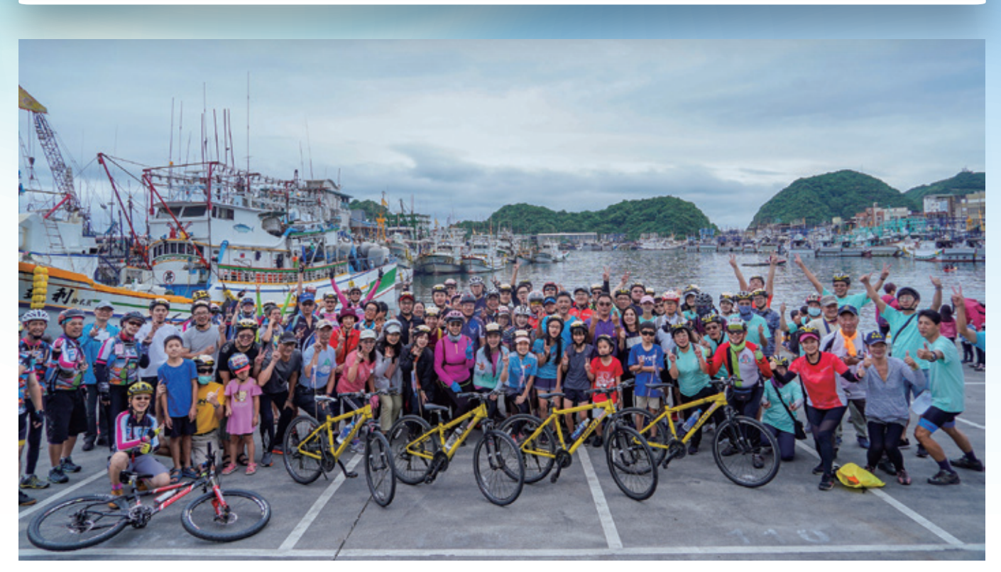
Group photo from the Mountain-sea Cycling Path at Nanfangao paced cycling event

Top Cycling Routes in Taiwan – Riders Gather in Yilan to Ride on the Nanfangao Mountain-Sea Cycling Path