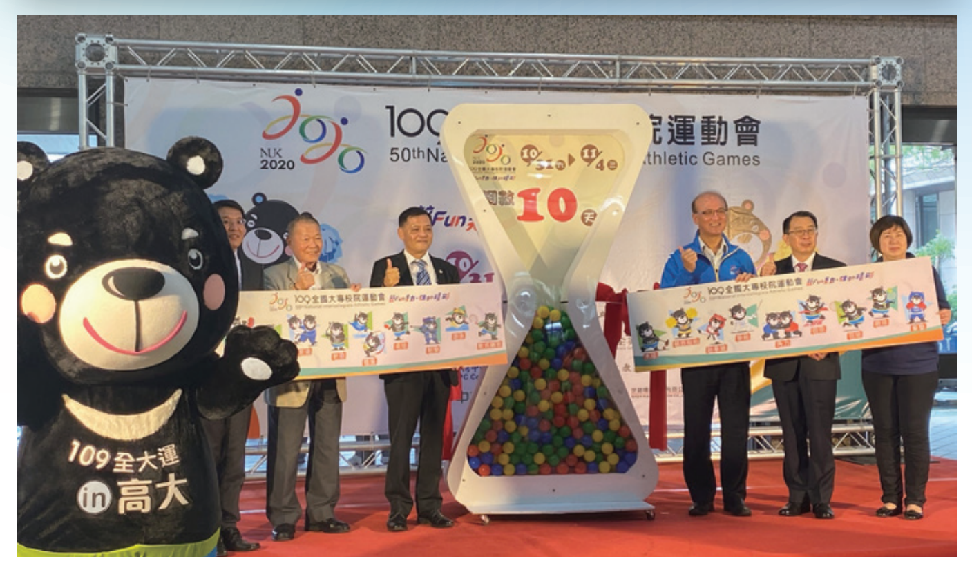
2020 National Intercollegiate Athletic Games

50<sup>th</sup> National Intercollegiate Athletic Games Opens at National University of Kaohsiung on October 31