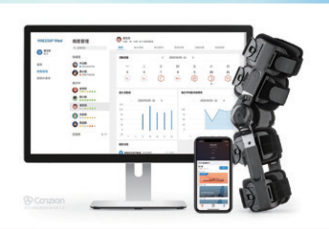
Just like taking a physical therapist home

Conzian is a company focused on smart rehabilitation. The main product KNEESUP Care