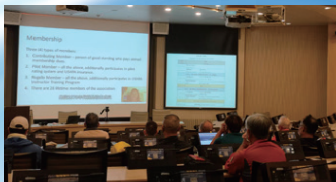
The Sports Administration invited experts from the US and Japan to share their unpowered flight systems and experiences

trends in different countries and will serve as reference for the promotion of innovative policies and system domestically, to allow operators and training units to promote the beauty of flying sports in more exciting ways so that unpowered flying sports can develop strongly in Taiwan.