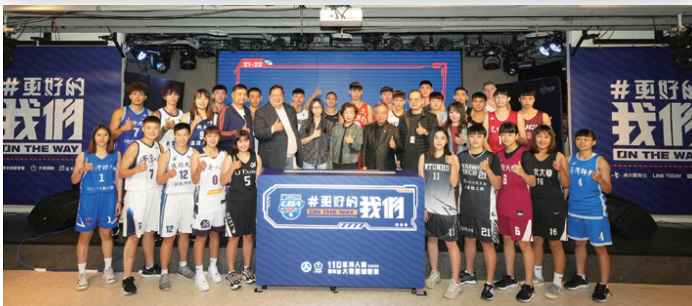
"Better us, better UBA" 2021 Fubon Life University Basketball Association press conference

This year (2021), the participating teams have made every effort to prepare in the face of the pandemic. 2021 Fubon Life University Basketball Association (UBA) has "Better Us" as its spirit. The Sports Administration hopes that players and staff of participating teams can convey positive energy in the competition through their efforts to overcome challenges and exceed the self.