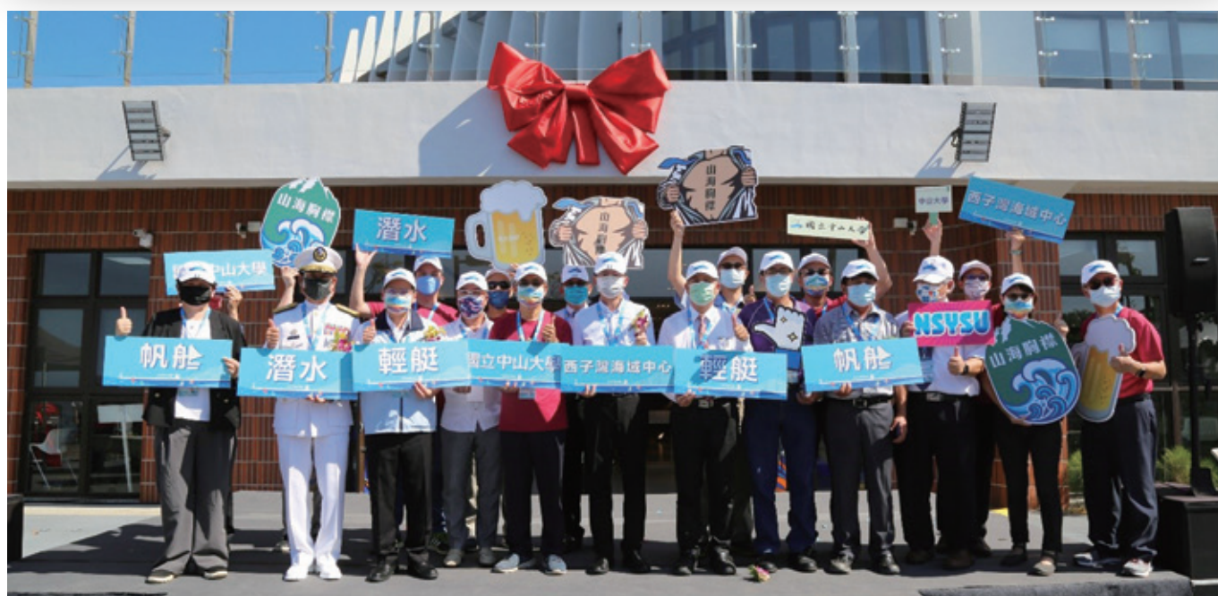
Kaohsiung NSYSU Sizihwan Marine Center opens