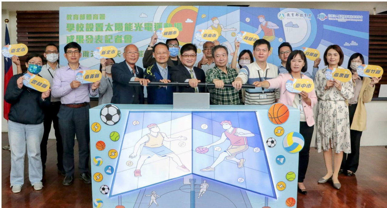
► The Sports Administration held an achievement presentation press conference on establishment of photovoltaic courts by schools

In recent years, affected by extreme weather and climate change, high temperatures and drought and sudden torrential rain have been caused, the unpredictable weather shortening student PE classes or after-class activities and making solving the problem of lack of indoor space an urgent issue. The Sports Administration expanded the promotion of the “program for expansion of the establishment of photovoltaic all-weather courts” at the end of 2018, using government and civil sector cooperation to build