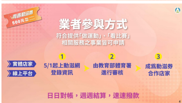
► Youth Sports Vouchers plan