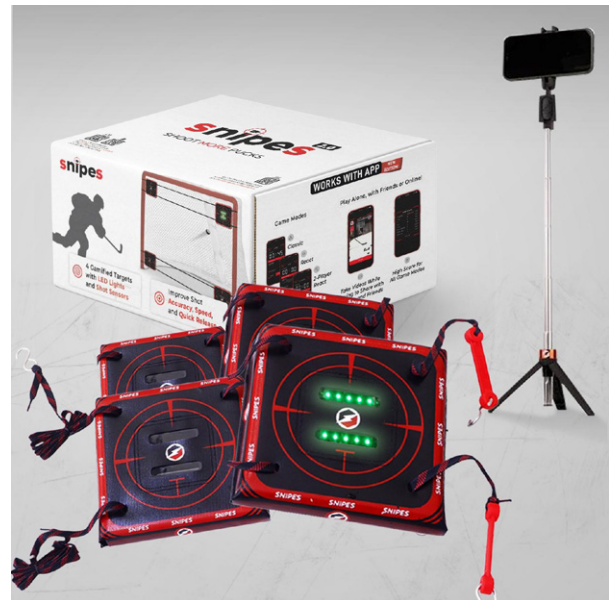
► Product of Bolt Sports Co. from Canada

analysis, as well as adding an element of fun to make training more diverse.