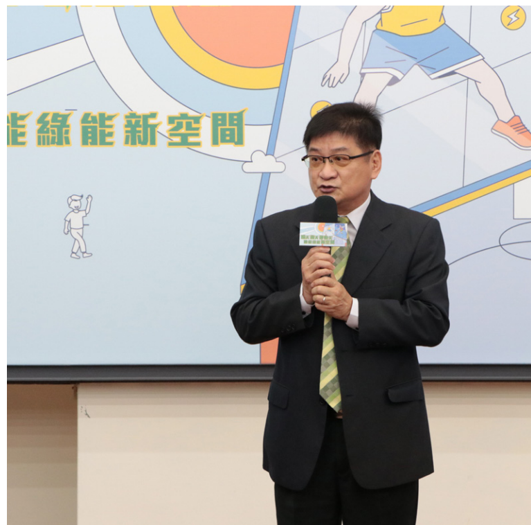
► Opening remark by Deputy Director-General Hung Chih-chang

As well as private operators investing in the establishment of photovoltaic courts, the first such court with an electricity storage system in Taiwan has recently been donated to a school. Various methods are being used to allow students and teachers to enjoy a comfortable and safe sports environment regardless of the weather while also making a contribution to green energy and reaching the objective of “fitness and green energy new space for any weather”.