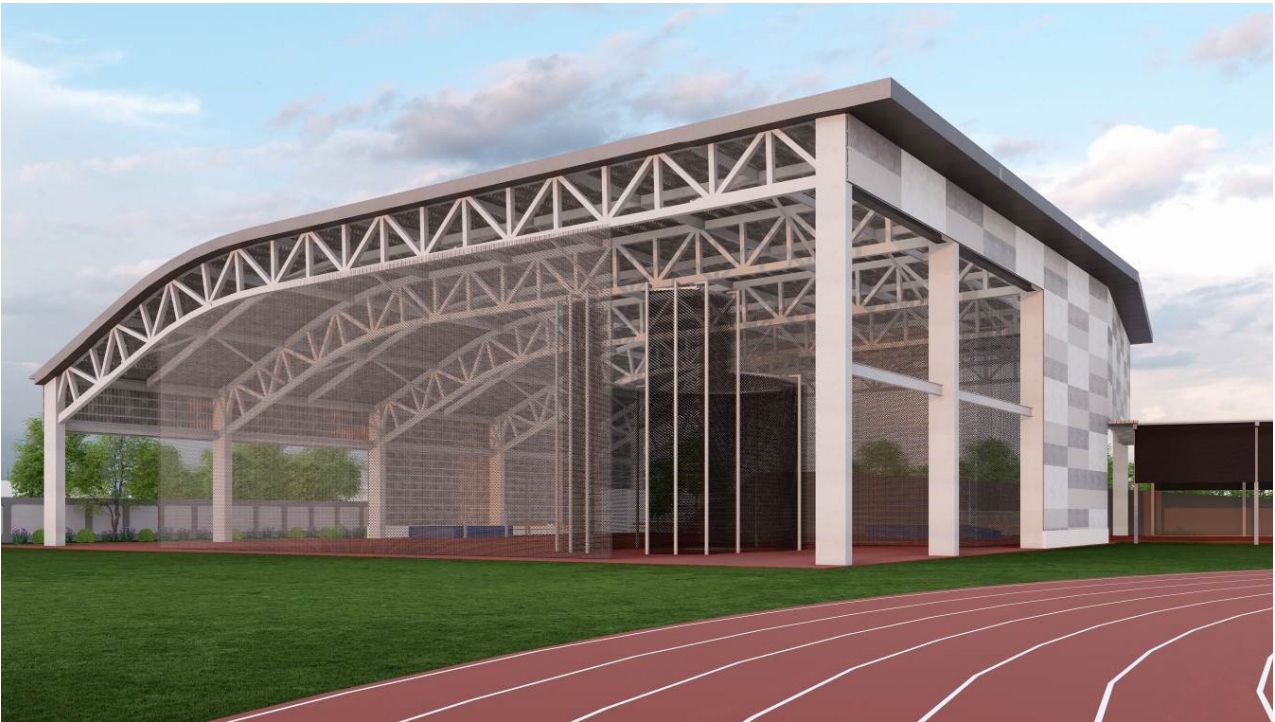
► Simulation diagram of the all-weather throwing field at the National Sports Training Center

In the past, athletics training has all been conducted outdoors, including shot, discus, hammer, high-jump, pole-vault, and javelin. The Sports Administration has planned an all-weather throwing field for the south side of the National Sports Training Center's all-weather track to provide athletes with a training venue for 365 days a year, to give them a better environment for competitive sports training.