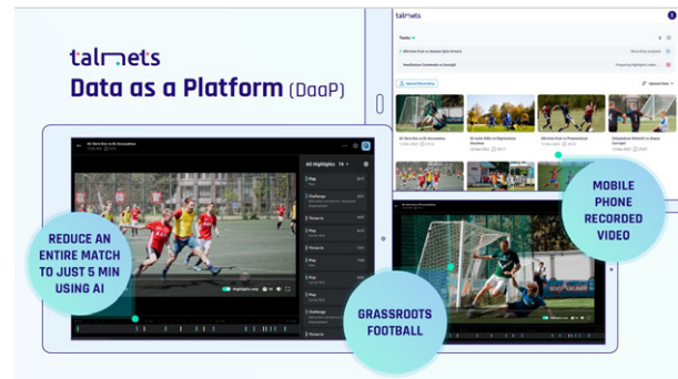
► Product of Talnets from Switzerland

Talnets is a company focused on football talent intelligent identification technology. With data as the platform, using AI imaging analysis technology, Talnets can easily compress the infor-