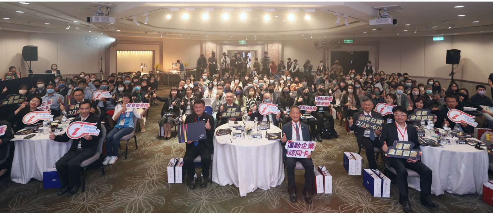
► Group photo of guests at the Sports Enterprise Certification launch ceremony and northern area explanatory meeting

The Sports Administration has held Sports Enterprise Certification for 8 years in succession, with 574 enterprises certified and 1.06 million employees benefitting so far. It is becoming the norm for enterprises to attach importance to employee sports.