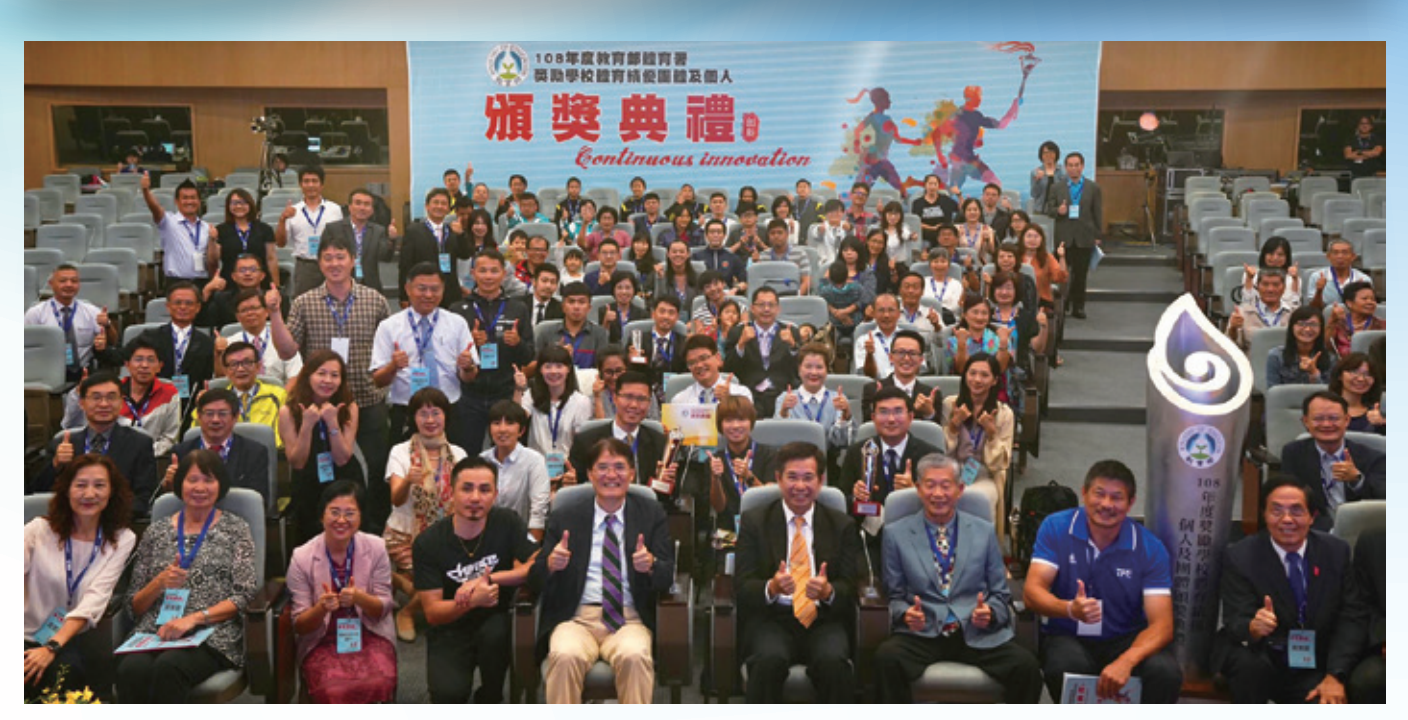
2019 Outstanding School Sports Team and Individual Awards Ceremony

School physical education aims, through sports, to promote the mental and physical wellbeing of students, developing lifelong sports skills and cultivating dynamic lifestyle habits. In addition, the use of benchmark courses and high-quality teaching materials to empower teachers and support the system are a focal point to raise the level of quality of sports teaching in schools. The aim is to increase the habit of students to engage in physical activity other than in physical education classes and achieve the target of SH150 (students accumulate more than 150 minutes of physical activity per week). This seeks to nurture student's sports skills and interests, laying a foundation for regular exercise, as well as the habit and attitude of lifelong exercise.