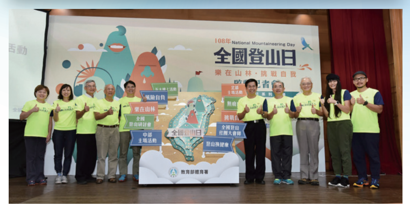
The Sports Administration joins with climbing associations and industry to hold a series of National Mountaineering Day activities

National Mountaineering Day activities were launched across Taiwan on September 9, 2019. This year, more than 200 mountaineering activities were planned in conjunction with mountaineering associations in 22 cities and counties across the country and together with companies, the diversity of routes leaving members of the public spoiled for choice. The main activities are scheduled for October 6 in Taipei, Taichung and Kaohsiung, with almost 10,000 people invited to enjoy the beauty of the mountains. One important event is the National Mountaineering Seminar which will be held from September 27-28 at The Great Roots Forestry Spa Reserve. The seminar has invited more than 200 mountaineers to discuss mountaineering policy and the development of mountaineering activities, in the hope of sparking new ideas through the interaction of government, industry, academia and climbers. This year's National Mountaineering Day activities are also combined with an online new