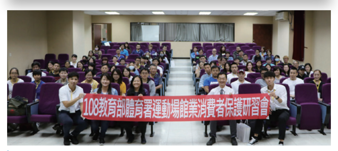
2019 Sports Venue Consumer Protection Seminar Opening ceremony group photo

Increasing the Consumer Protection Knowledge of Sports Venues, Building an Improved Sports Consumer Environment