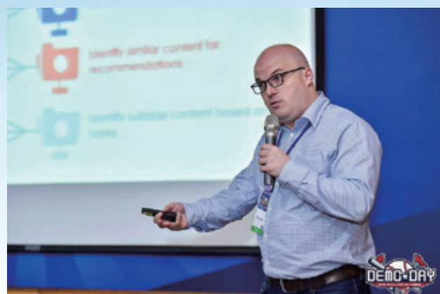
2019 HYPE SPIN Accelerator TAIWAN

FASSOO U.G. is a SaaS (Software-as-a-Service) AI image analysis platform that supports multiple languages. It mainly takes online images and uses AI, computer technology and machine learning to automatically create metadata and a data platform for film content. The platform allows people to upload videos and picture files, automatically bookmarks people, events and objects, as well as indexing specific bookmarks. The system's main analytical processes include: intelligent keyframe extraction, facial and object recognition, interpersonal interaction recognition, language and LOGO symbol recognition etc. As such, it helps people to locate better, more precise sports related analysis and proposals. Whether sports teams, sports brands, or sponsors the system helps find key content in which to invest marketing resources in a quicker and more organized