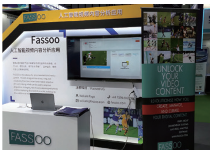
2019 Nanjing Tech Week / SLUSH China 2019

manner or helps analyze the exposure or reach of a brand during competitions. Currently, FASSOO U.G. is focused on the development of sports and cooperates with many top sports agents, so SaaS system services can provide sports teams with simpler and clearer advertisement investment statements, and more effectively promote their advertisements online.