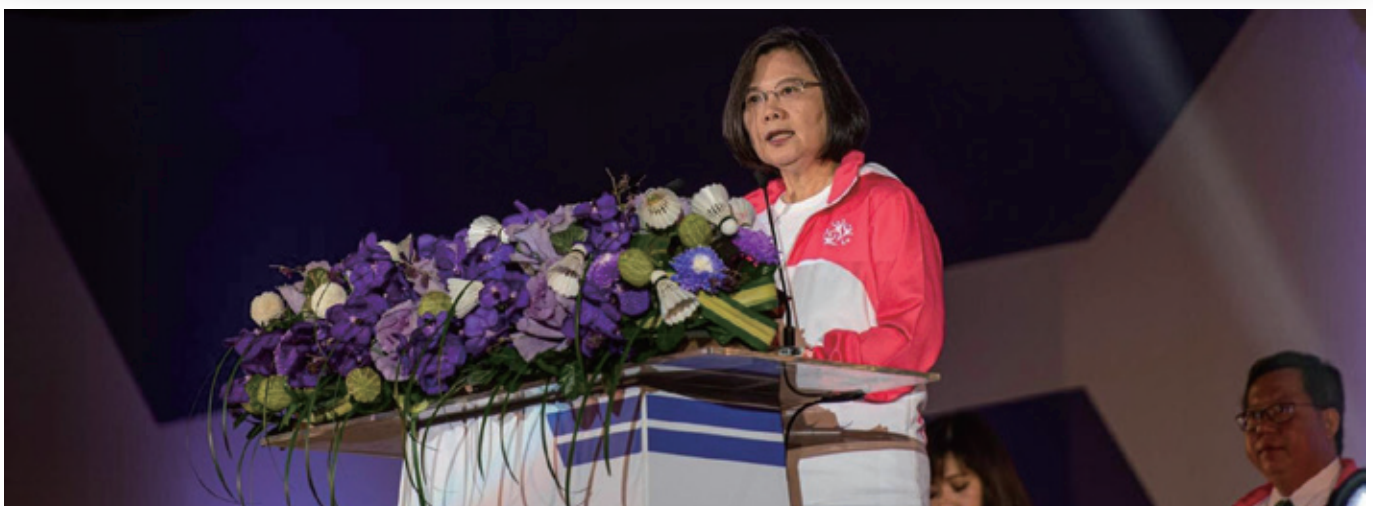
President Tsai gave a speech at the opening ceremony of the 2019 National Games