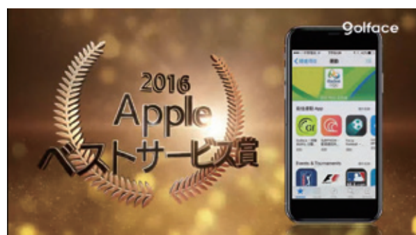
Golface won Apple Store best sports app and iOS/Android best selling sports app

connects all major golf courses in Taiwan, and has already enabled a tee reservation function. The app can still be used after entering the course to track the fairway and flag position, even providing strategy advice and a convenient method of score calculation and performance recording. For example, before teeing off you can watch high-quality aerial video