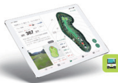
Golface Store is the most comprehensive course booking platform featuring tee reservations for all of Taiwan's top golf courses

Golface is a software company dedicated to of golf. It was created in 2013 to provide a service platform for golfers and courses. The app already has a stable base in Taiwan, and last year established a subsidiary company in Fukuoka, Japan, to begin expansion overseas. Simply put, using smartphone software, the app