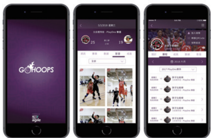
Screenshots of MeetAgile's GoHoops match data management platform

In 2018, the Sports Administration commissioned National Chiao Tung University's Center of Industry Accelerator and Patent Strategy (IAPS) and HYPE Sports Innovation (HYPE) to jointly establish SPIN Accelerator Taiwan. The aim was to utilize the technology network of IAPS and its experience of nurturing almost 100 startup teams to help the teams taking part in this project to carry out technological integration spanning technology, manufacturing and service industries, and take advantage of HYPE's international sports innovation resources to quickly enter the international market and offer more possibilities to Taiwan's sports startups. The second cycle of this training project involved 9 outstanding Taiwanese sports startup teams with potential, and they officially completed the course in July 2019. Two of the qualifying teams, Singular Wings Medical and Armony Ltd., have already been announced via early electronic announcements, and we will now introduce the remaining four sports startups MeetAgile, Golface, FASSOO U.G. and LUDO: