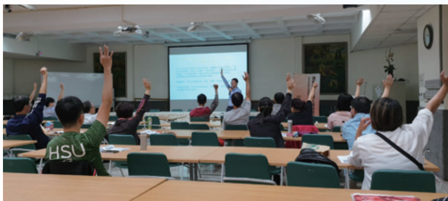
Seminar topic: Awareness of Disabled Sports

on October 7th, 21st and 22nd. The courses set out to improve specialist knowledge of participating staff and provide a more accessible sports environment for the public through awareness lectures, interactive activities and sharing of experience.