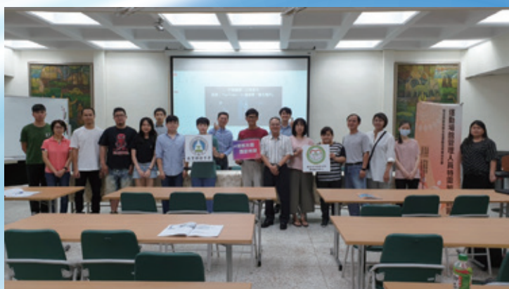
Group photo at the Sport Administration's 2019 Sports Venue Management Special Needs Awareness Seminar (2nd Taipei seminar) October 22nd 2019

In order to increase the soft power of sports venues, the Sports Administration commissioned National Taiwan Normal University and the League for Persons with Disabilities, R.O.C. to host the 2019 Sports Venue Management Special Needs Awareness Seminar. The main themes of the seminar were the rights of disabled persons to participate in sports, sports venue services and awareness of disabled