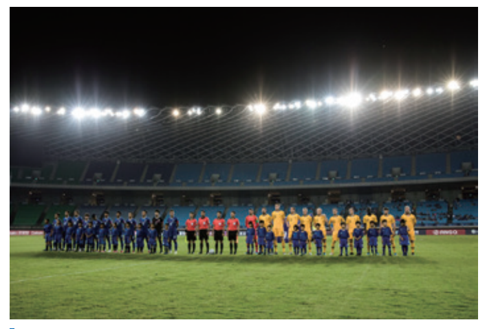
Australia and Taiwan before 15 October 2019 football game in Kaohsiung

Our sporting relationship also extends to amateur and youth sports. In April and May this year, Taiwan sent the largest international delegation to the Arafura Games in Darwin – a youth sporting competition in which almost 2,000 athletes participated. In 2019 Australian athletes and teams have come to Taiwan to compete in baseball, basketball, marathons, iron man, football and other sporting competitions.