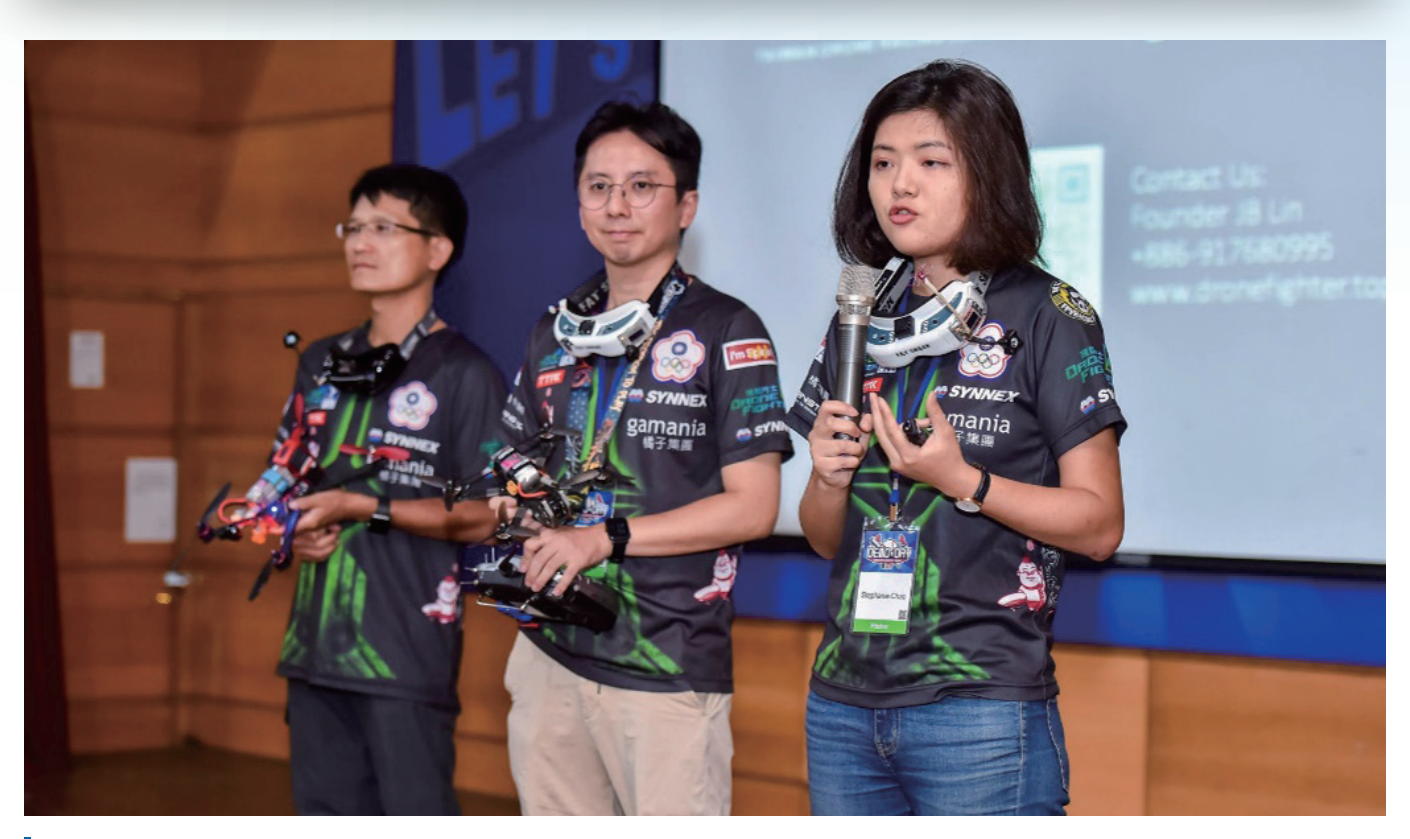
The DroneFighter Team Explaining Their Products and Displaying Drones and Accessories at the SPIN Accelerator Taiwan Demo Show

DroneFighter Co., Ltd runs drone racing competitions. Drone racing is very popular around the world and is the fastest-growing esport. In competition, competitors wear dashing FPV glasses and have an experience like that of a fighter pilot as they guide their drone through obstacles at 150 kmh. The sport can be described as the F1 of the air. The biggest