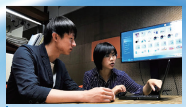
LongGood Meditech at work

in special educational institutions. The product provides a professional, safe and multifunctional integrated system to assist medical personnel in assessing and measuring along with tracking management and providing safe and effective rehabilitation programs.