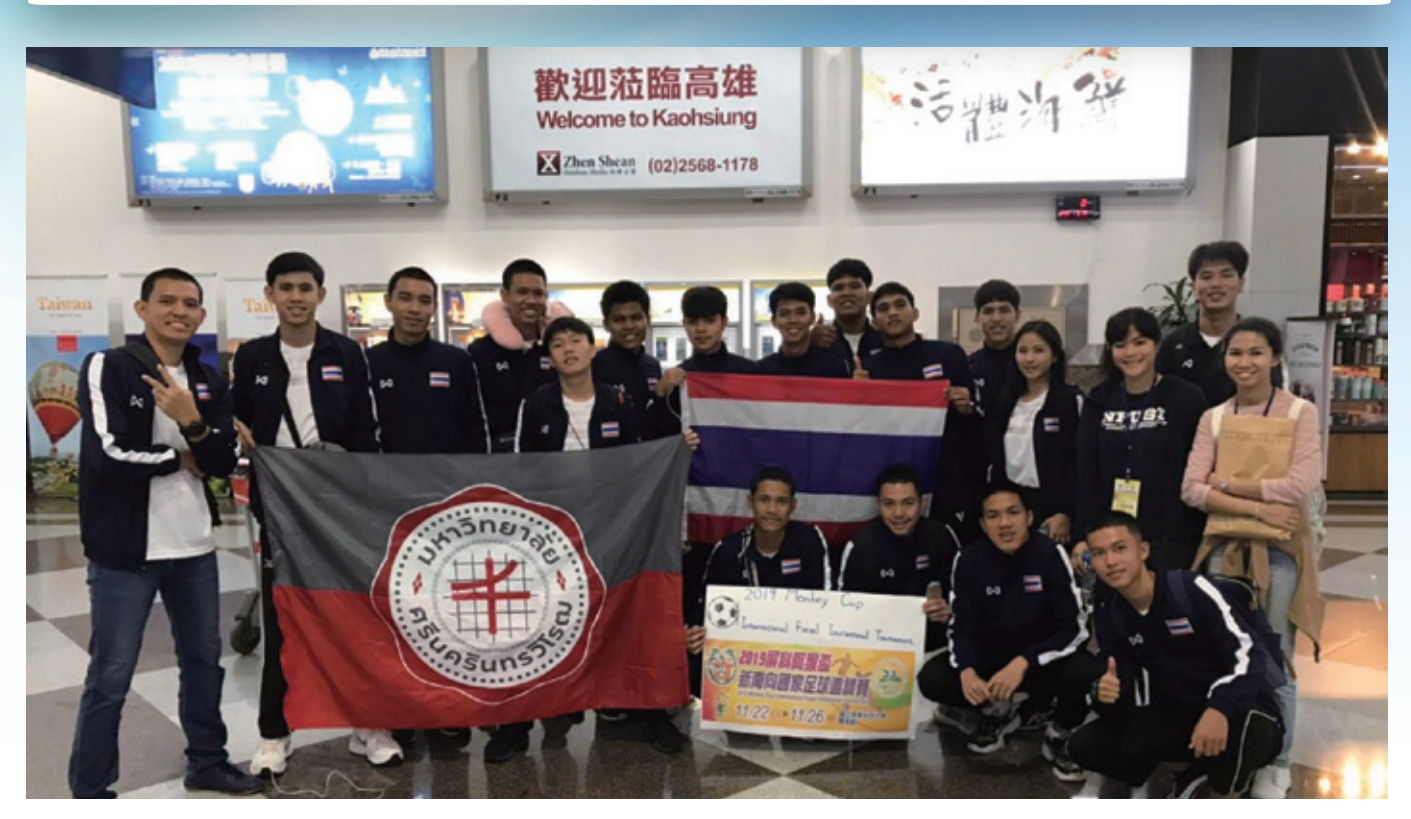
2019 Monkey Cup International Futsal Invitational Tournament—Srinakharinwirot University

2019 Monkey Cup International Futsal Invitational Tournament Eight schools from four countries go mad about football