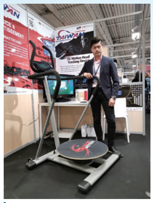
Silver medalist at the Concours Lépine International Paris 2019 Invention Exhibition

Jianling Technology is a provider of smart health/ fitness and rehabilitation equipment and systems. The world's first SmartMotion intelligent management system combines body detection, fitness or rehabilitation equipment with motion sensing devices, IoT systems, APPs and the cloud, for a fully intelligent management system. The system can then be applied in such locations as sports centers, gyms, rehabilitation centers and care centers for the elderly. For these fields, the SmartMotion system can be subdivided along two main axes of usage. One being that it provides a total solution for body detection, such as body composition analysis, blood oxygen, cardiorespiratory endurance, muscular endurance and flexibility. The SmartMotion APP records all the detection data and assists users with creating their