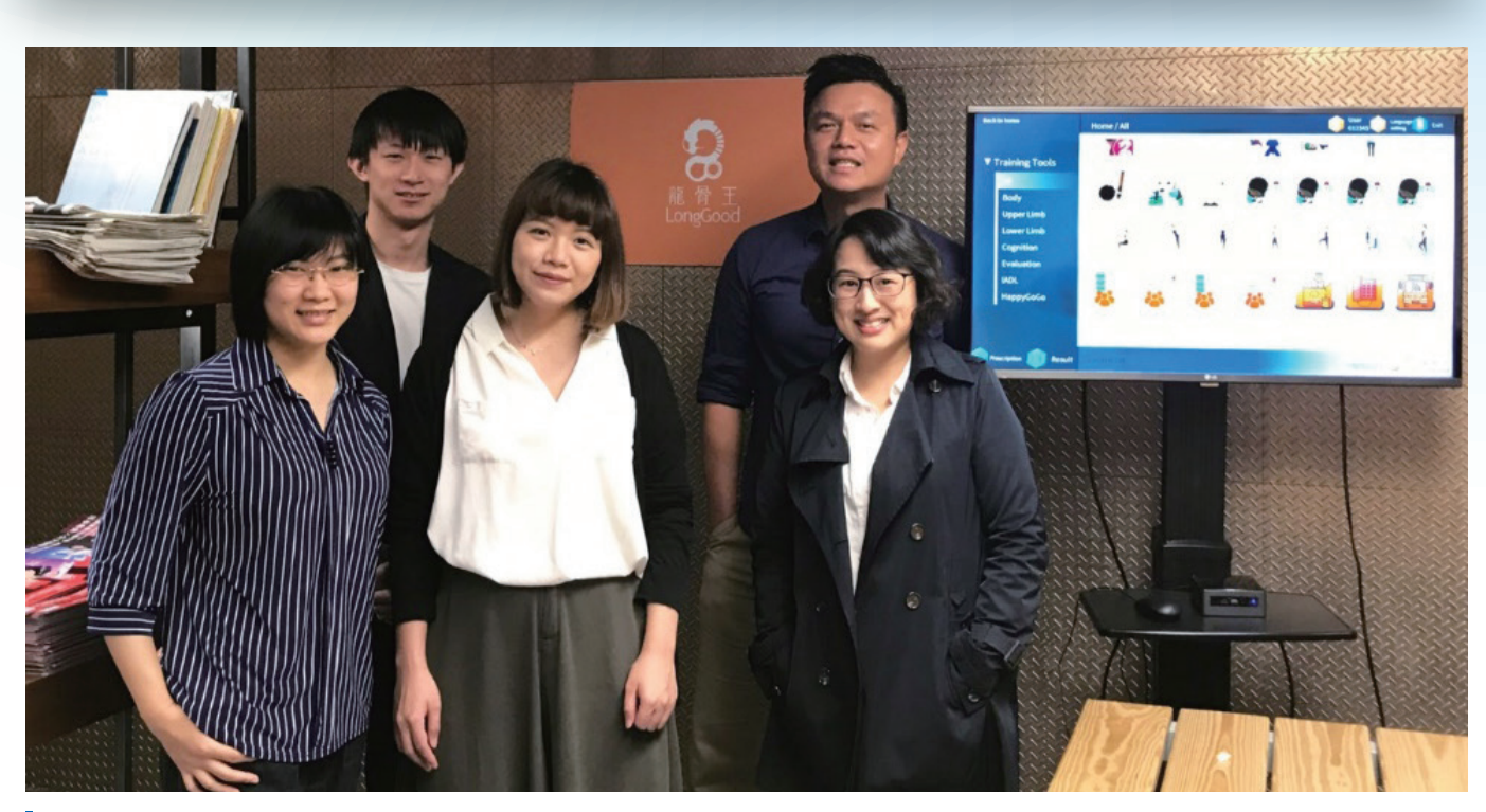
Meet the LongGood Meditech team

LongGood Meditech is a software development company from Taiwan that uses smart interactive technology and rehabilitation medicine together. It is also the only company in Taiwan developing multi-faceted smart rehabilitation software, from assessment to rehabilitation training, physical therapy, occupational therapy to cognitive functional training. One of its core objectives is to alleviate some of the burden in clinical rehabilitation treatment by enabling junior medical personnel to assist in rehabilitation medicine.