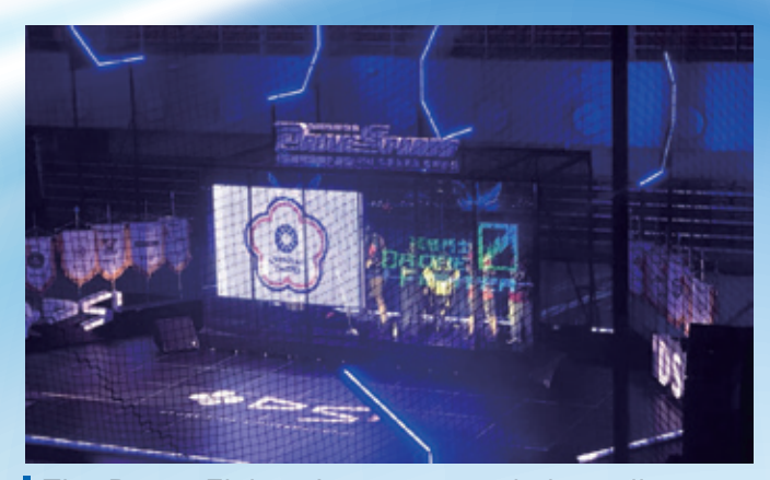
The Drone Fighter League team led an elite team of drone pilots from Taiwan to take part in the Drone Racing World Championships in South Korea

international drone flying competitions in Taiwan are held by DroneFighter. They also plan to take this super cool e-sport into a broadcast program that will be shown on TV in Taiwan and streamed live on the Internet in future. If you want to make an eye-catching program, don't miss the DroneFighter League!