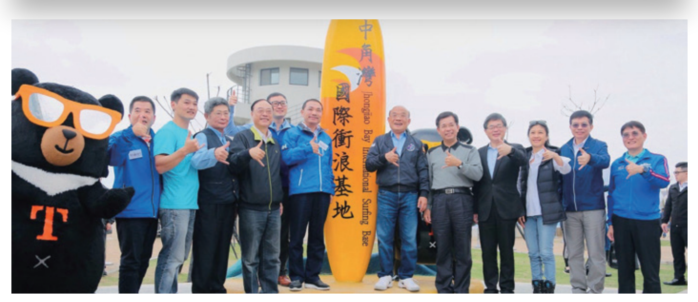
Jhongiiao Bay International Surfing Base opening ceremony