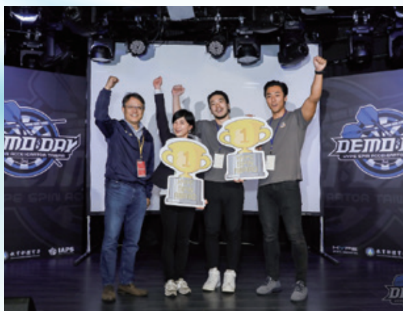
IAPS award-winning teams Stryde and Red_Dot_Drone

massage guns and lightweight design patents.