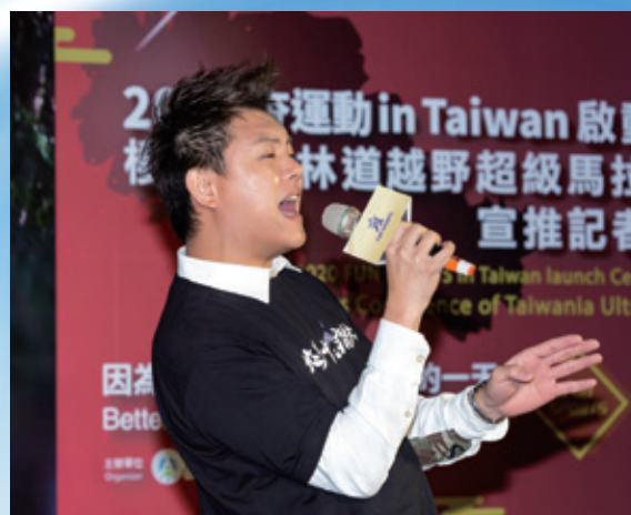
Well-known singer Mark Chang performs the new event theme song "The Pleasure of Challenge"

largest surviving stand of Taiwan Cypress trees and the distinctive scene well-known at home and overseas the Three Sisters Sacred Trees (Cryptomeria-like Taiwania). The documentary made by National Geographic Inside: Taiwan's Ultra Marathon filmed on-site was shown repeatedly in Taiwan and overseas, receiving rave reviews and winning the Non-drama Photography category at the 54th Golden Bell Awards. At the press conference, singer Mark Chang gave a stirring rendition of the new event theme song