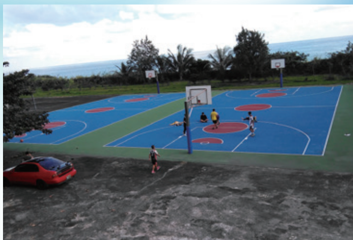
Site of Changbin Junior High School's covered playground