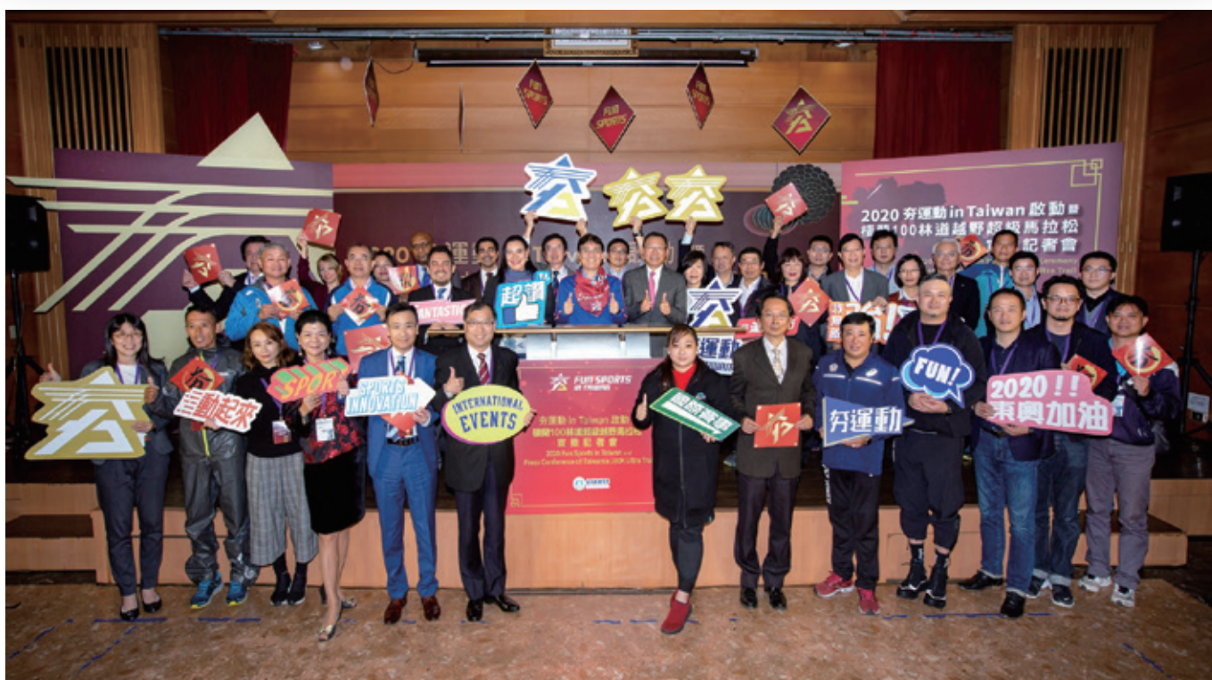
Group photo for 2020 Fun Sports in Taiwan and Press Conference of Taiwania 100K Ultra-Trail