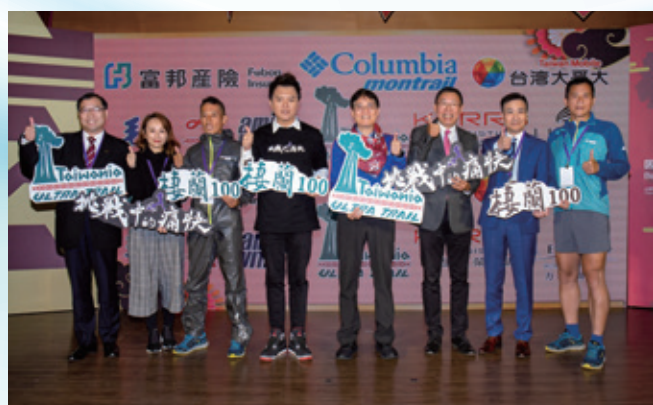
■ Taiwan 100K Ultra-Trail sponsors' group photo

The Sports Administration, Ministry of Education, and the Chinese Taipei Association of Ultrarunners held the 2020 Fun Sports in Taiwan Launch and Press Conference of Taiwan 100k Ultra-Trail on January 21. In coordination with the Executive Yuan's policy of "molding international competitions with a Taiwan brand", the press conference was combined