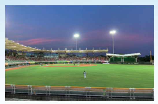
Hualien County Baseball Field Friendly Facilities Improvement Plan- After construction

venues and facilities, building friendly cycle ways and improving the water sports environment.