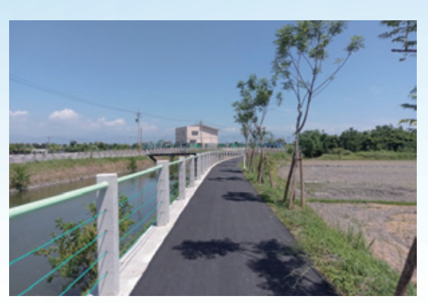
Township, Yilan County- After construction

Also, to encourage the elderly and people with mental and physical impairment to actively engage in sports, venues for sports that are suited to the elderly, such as croquet, and the support facilities that the mentally and physically impaired or disabled need when doing sports, such as barrier-free access, chairs for entering swimming pools, barrier-free washrooms and changing rooms, and necessary support equipment, are also the focus