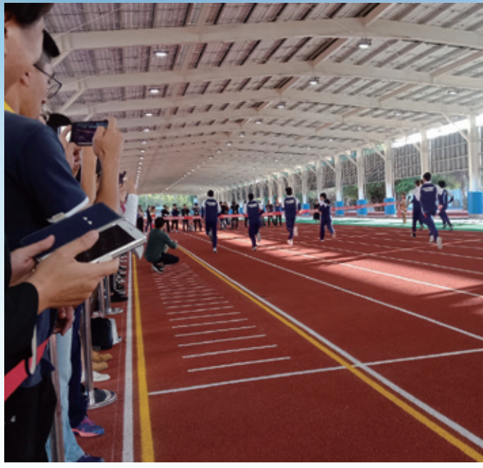
equipment at Kaohsiung Municipal Sanmin High Training Center School