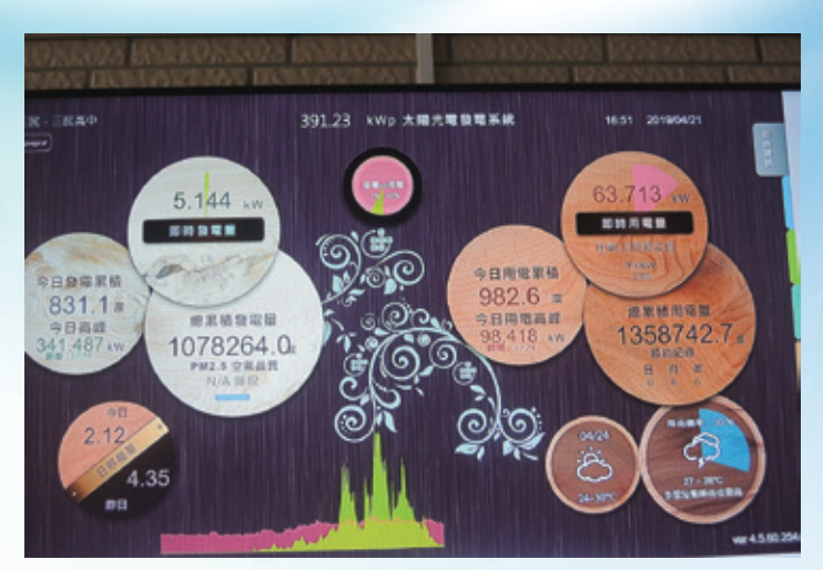
Monitoring system of the instant power generation equipment of Kaohsiung Municipal Sanmin High School

enhancing their immunity, relaxing mind and body, and increasing their study willingness and capability; local communities also benefit as they now have a place where they can exercise that is sheltered from the sun.