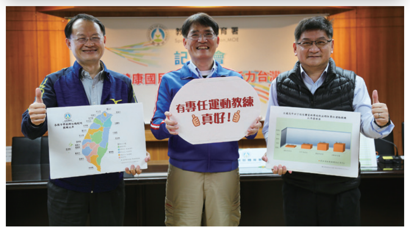
Sports Administration Director-General Kao Chin-hsung optimistically expects that at the end of this year the proportion of schools at all levels employing a dedicated sports coach will reach 90%

Sending Good Judges of Talent Onto Campuses-Big Increase in Percentage of School Sports Courses Employing a Dedicated Sports Coach