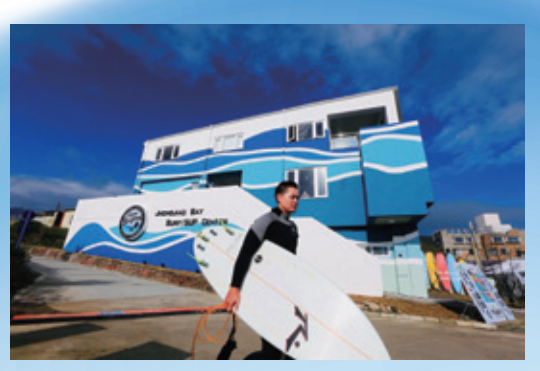
Jhongjiao Bay SURF/SUP Center Plan in Jinshan District, New Taipei City- After construction

The Sports Administration stated that the Program for Building a Leisure Sports Environment has three main directions: building high quality and friendly sports