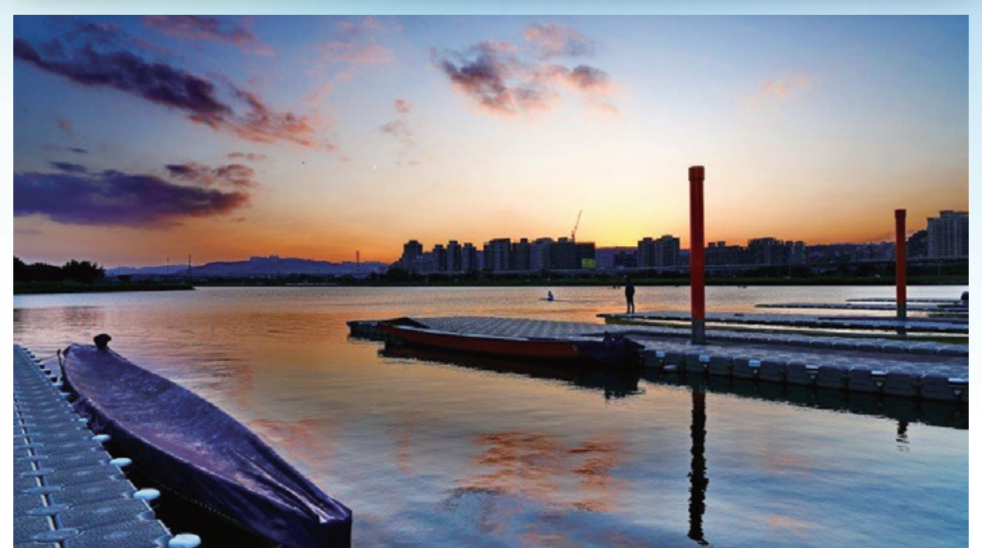
Improving the water sports environment of Erchong Floodway Breeze Canal in New Taipei City

The Sports Administration continues to provide a diverse sports environment; from September 2017 to the end of 2019, 200 local government sports facility building or renovation cases, establishment of 29 circular cycle paths, optimization of 408.95 kilometers of existing cycle path and improvement of 16 water sports venues were subsidized under the Program for Building a Leisure Sports Environment. 62 sports facilities including athletics tracks, basketball courts, sports fields, cycle paths and water sports venues have successively opened for public use after the completion of construction and have been well-received. The new or improved sports venues and facilities have increased the willingness to engage in sports of many people who love sports but previously had nowhere suitable to do sports.