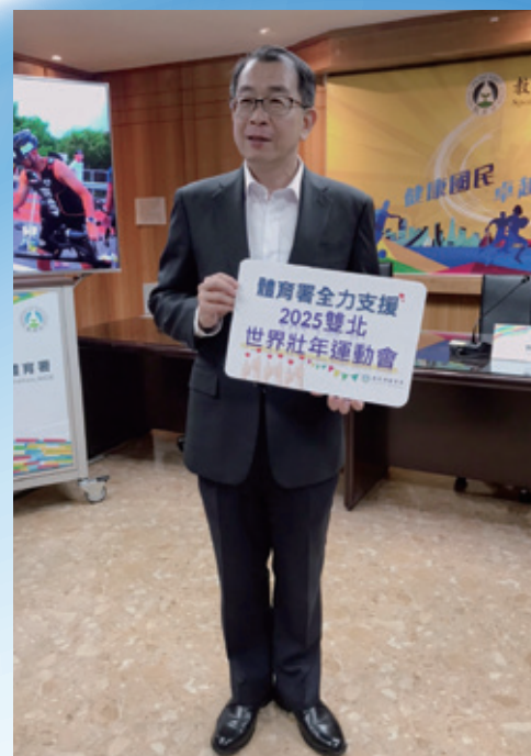
The Sports Administration will fully support the 2025 World Masters Games

At present, the event is set to be held in May 17-30 2025, when the weather is suitable and away from typhoon season and the peak travel season. 32 sports have been selected and there will be 84 venues spread across Taipei, New Taipei, Hsinchu, Taoyuan and Yilan with peripheral transportations and accommodations. It is estimated that more than 30,000 people will gather in northern Taiwan and substantial tourism benefits will be received. The Sports Administration stated that both Taipei City and New Taipei City have experience of hosting large scale sports events. The hosting of the World Masters Games will once again allow the world to see the characteristics of Taiwan's sport, culture and tourism while also promoting Sport for All.