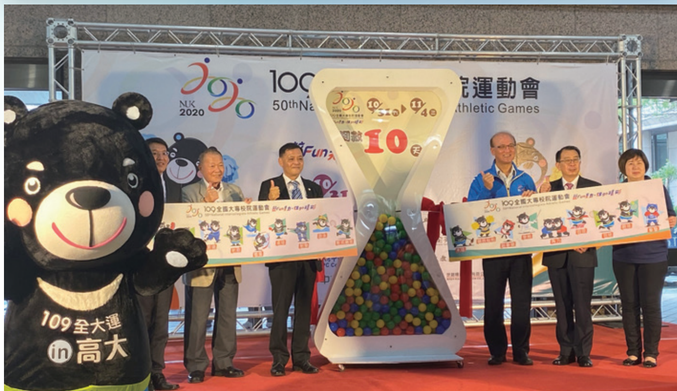
2020 National Intercollegiate Athletic Games

The countdown has begun for the 2020 National Intercollegiate Athletic Games. The organizers have announced that a complete competitive environment has been prepared for this grand sports events to allow the 9,157 athletes from 147 schools to show what they are capable of and achieve good results. They also invited everyone to join this grand sports gathering and cheer on the athletes.