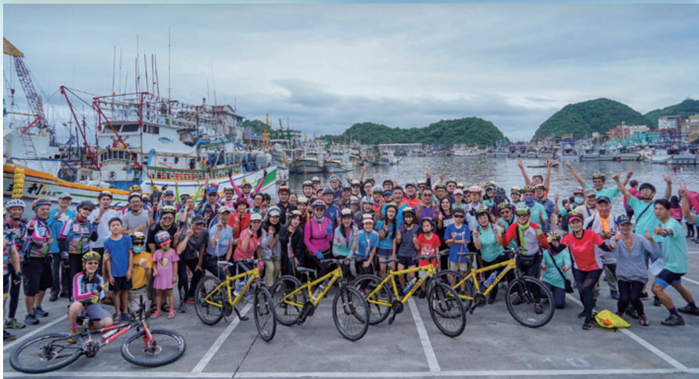
Group photo from the Mountain-sea Cycling Path at Nanfangao paced cycling event