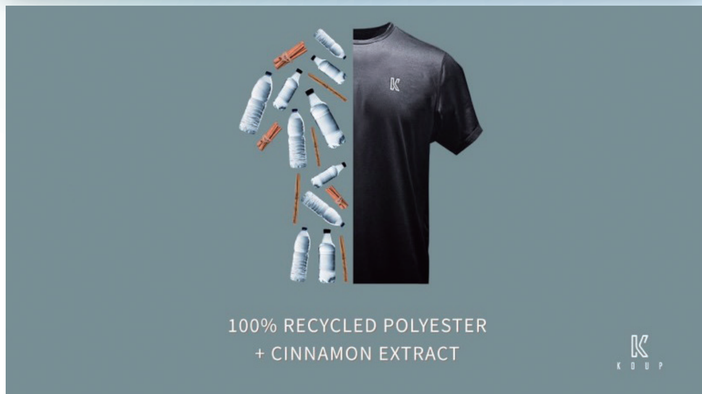
An item of clothing made from cinnamon and PET bottles

The HYPE SPIN Accelerator TAIWAN program is a joint effort of the Sports Administration and National Chiao Tung University's IAPS and Israel's HYPE Sports Innovation (HYPE). Starting from October 2018, four training cycles have been held; the fourth 3-month intensive training cycle began in May, 2020.