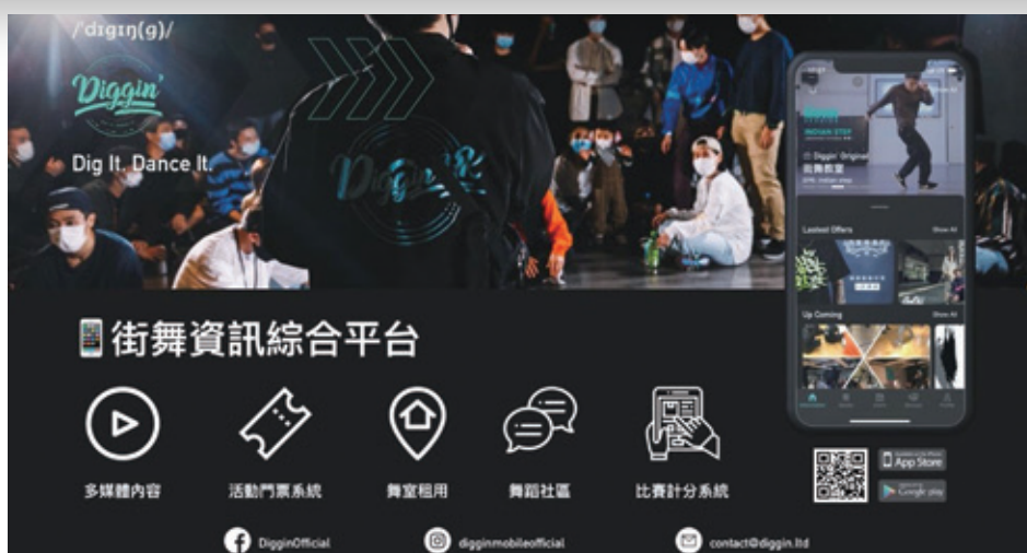
Diggin'-one stop street dance platform that links dancers around the world