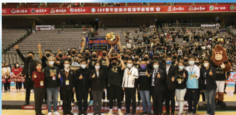
■ Taishan Senior High School won the HBL Final men's category

The finals from March 6th and 7th attracted more than 40,000 spectators. Moreover, the President of Taiwan, Tsai Ing-wen, along with the Vice President, Lai Ching-te, and commander-in-chief of the Central Epidemic Command Center (CECC), Chen Shih-chung, also participated in the 2-day event to cheer on the players.