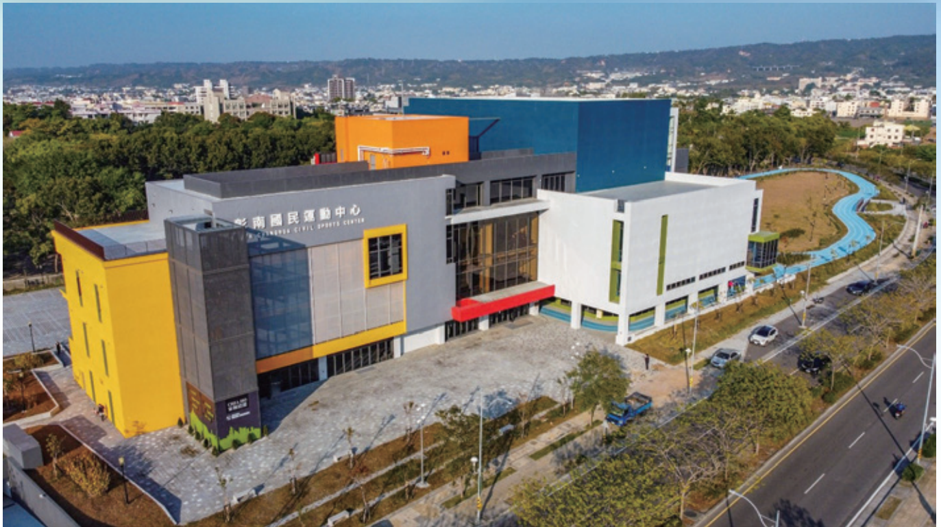
South Changhua Civil Sports Center opens

South Changhua Sports Center opened on February 27, 2021. The situation of sports centers in both north and south Changhua that people looked forward to has become reality.