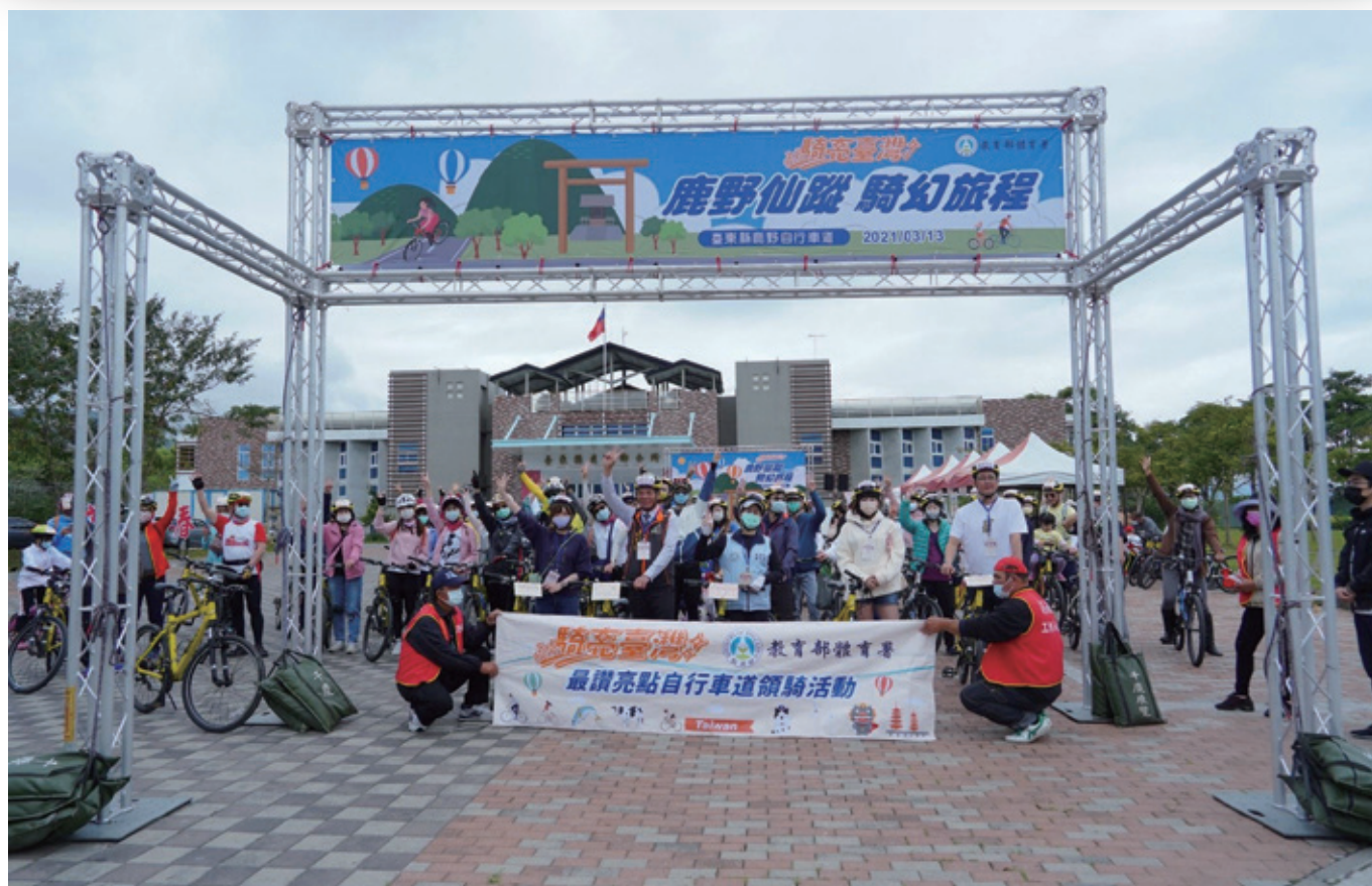
Group photo before the paced ride at Luye Bikeway, Taitung