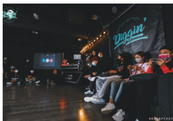
The Diggin' scoring system used by judges in dance competitions

Diggin' provides simple and fast solutions and