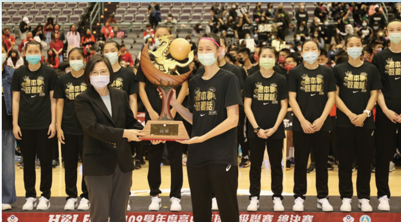
President Tsai Ing-wen (front left) presented the trophy to the HBL Final women's category winners Tamsui Commercial Industrial Vocational Senior High School

In the era of COVID-19, while most large-scale indoor activities are forbidden around the globe, Taiwan held an indoor basketball tournament with more than 40,000 participants. With high expectations of the Taiwanese people, Chinese Taipei School Sport Federation (CTSSF) held the High School Basketball League (HBL) Finals at Taipei Arena on schedule.