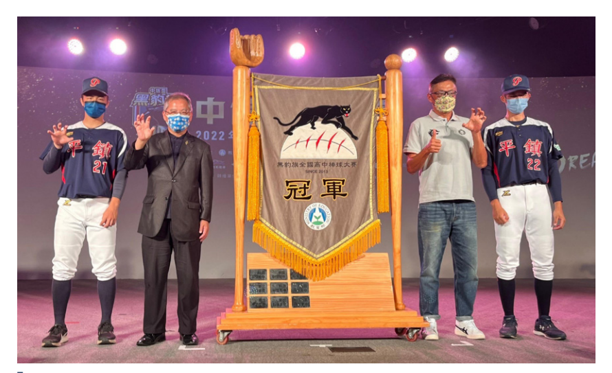
The last time winners Taoyuan Municipal Ping Jen Senior High School hand over the champion's flag

Senior High School and Taichung Municipal Wen-Hua Senior High School both have six female players registered showing an "explosion of girl power." Baseball can be free of limitations, of sex and merge into life. The Sports Administration hopes that, in future, more females will take the challenge and hit a life home run to create a different "female baseball new power."