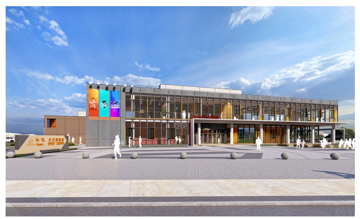
Schematic diagram of Hemei Civic Sports Center in Changhua County

Groundbreaking Ceremony for Hemei Civic Sports Center in Changhua County for Which the Sports Administration has Provided a Subsidy of NT$100 Million