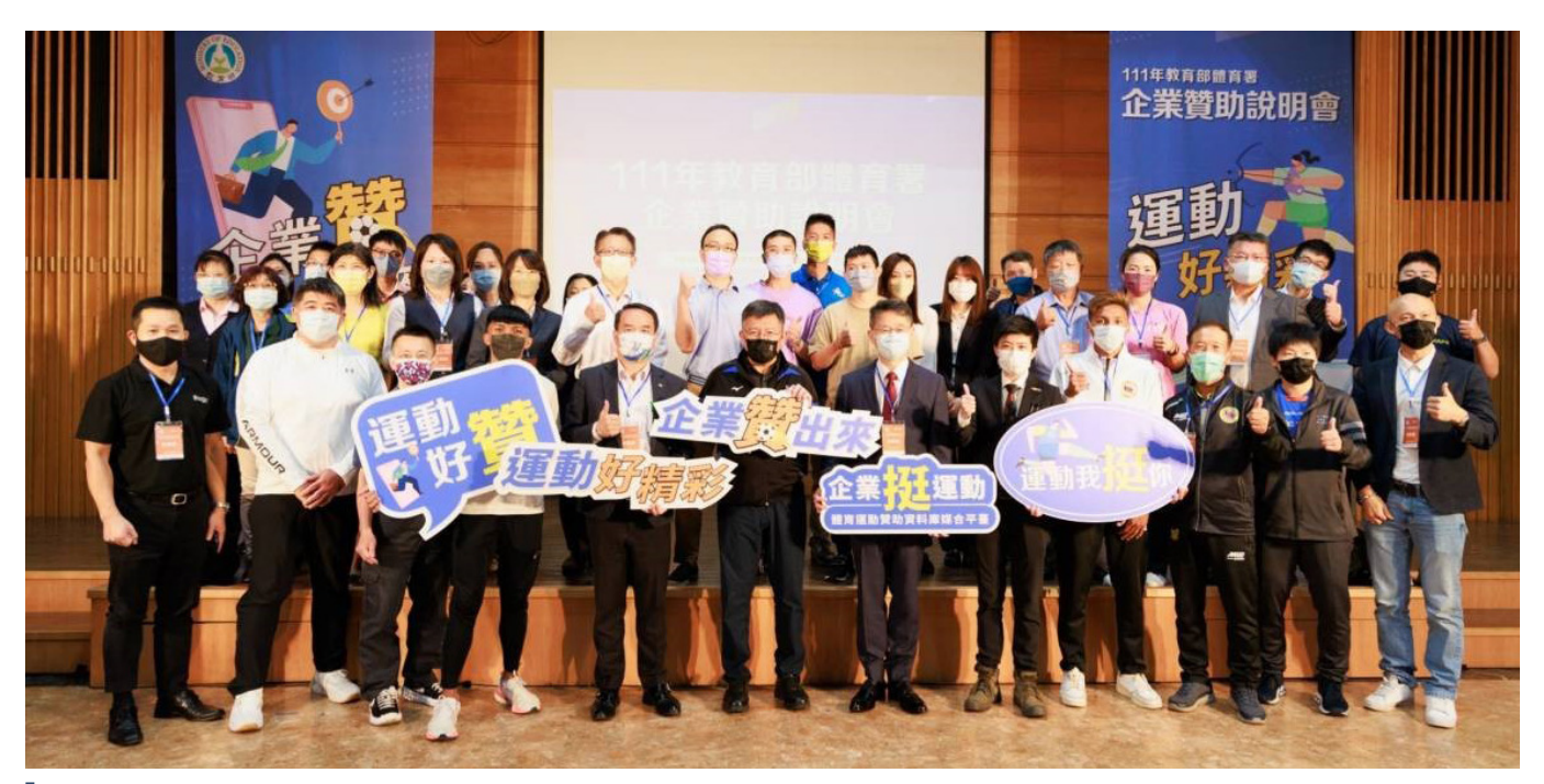
Related preferential tax regulations and processes etc. were explained at the 2022 Sports Administration corporate sponsorship explanatory meeting

To encourage enterprises to inject resources to support athlete training, Sports Administration held a corporate sponsorship explanatory meeting on 7<sup>th</sup> September, 2022. Private enterprises were invited to learn about related preferential tax regulations and processes.