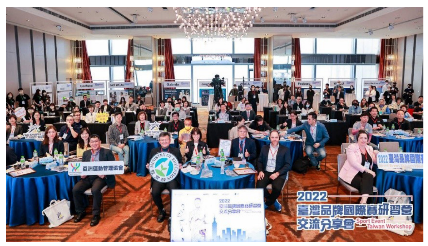
The Sport Event Taiwan Workshop held a physical exchange meeting on October 29

The Sport Event Taiwan Workshop Held a Physical Exchange Meeting on October 29<sup>th</sup>