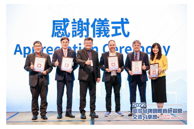
Certificates of appreciation were presented to the international cooperating units at the appreciation ceremony

mutual stimulation of inspiration, producing feasible proposals for execution that can serve as reference when sports event unit are organizing events in future.