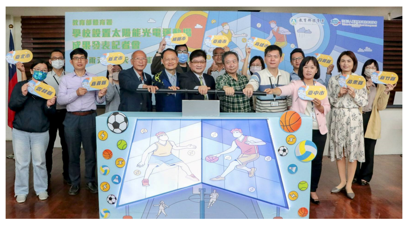
► The Sports Administration held an achievement presentation press conference on establishment of photovoltaic courts by schools

In recent years, affected by extreme weather and climate change, high temperatures and drought and sudden torrential rain have been caused, the unpredictable weather shortening student PE classes or after-class activities and making solving the problem of lack of indoor space an urgent issue. The Sports Administration expanded the promotion of the "program for expansion of the establishment of photovoltaic all-weather courts" at the end of 2018, using government and civil sector cooperation to build