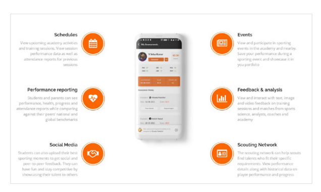
► Product of Dartle from India

Dartle provides an Athlete Management System (AMS) to sports clubs/schools/classrooms. The performance and progress of an athlete can be recorded, tracked and managed in the app and courses and menus can be designed