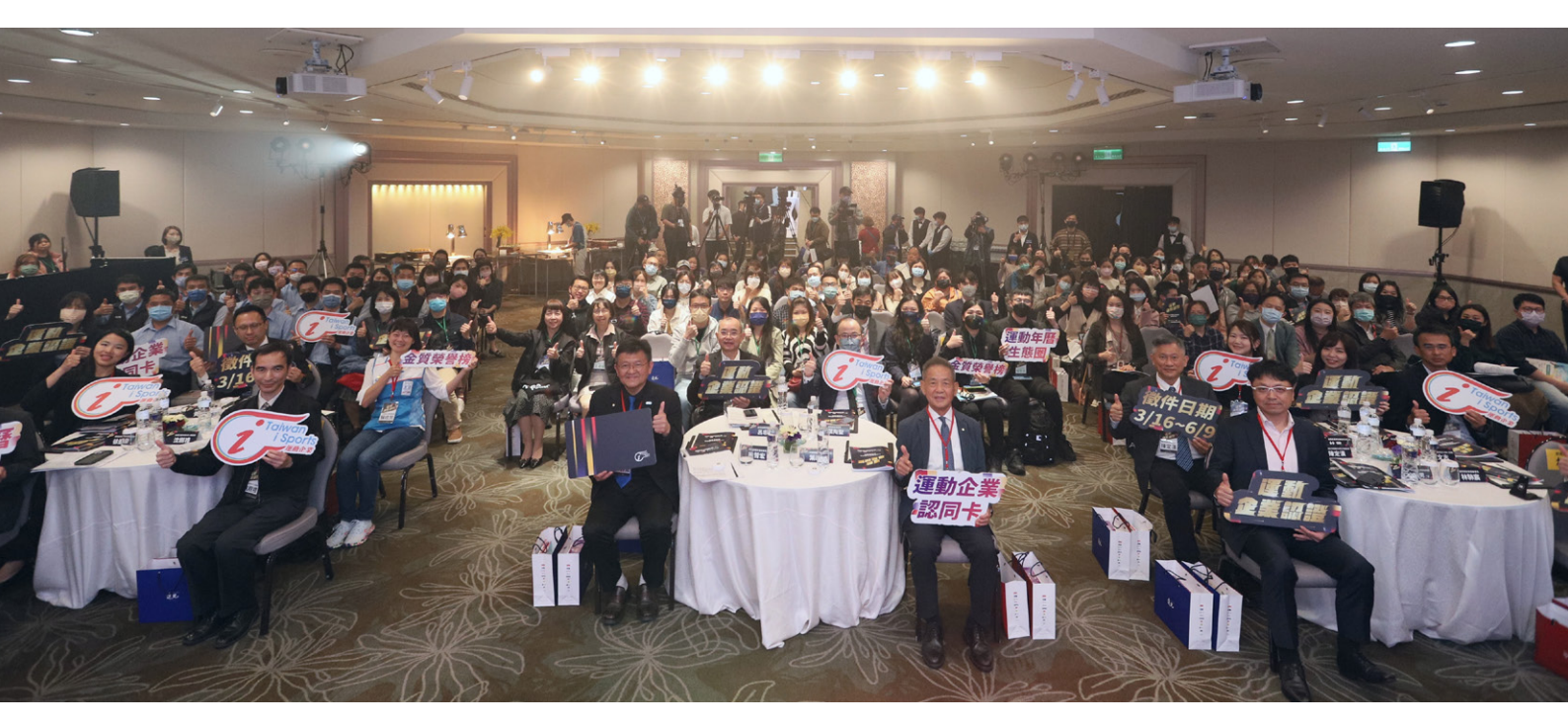
► Group photo of guests at the Sports Enterprise Certification launch ceremony and northern area explanatory meeting

The Sports Administration has held Sports Enterprise Certification for 8 years in succession, with 574 enterprises certified and 1.06 million employees benefitting so far. It is becoming the norm for enterprises to attach importance to employee sports.