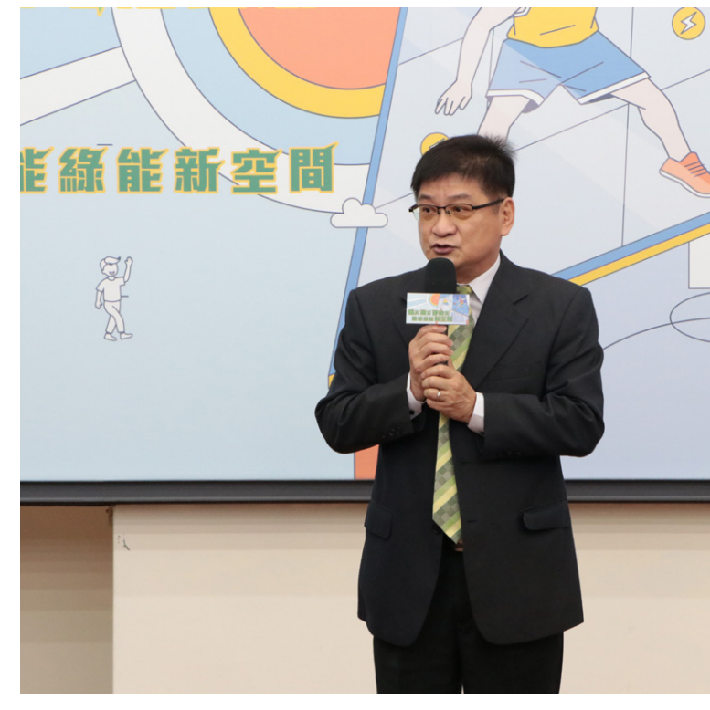
► Opening remark by Deputy Director-General Hung Chih-chang

Deputy Director-General Hung said that up to March 2023, 198 schools have built photovoltaic all-weather courts and 271 schools have such courts currently under construction. In future, guidance on the establishment of photovoltaic sports courts will continue to be given to cities and counties and schools to improve school sports facilities and raise the level of sports safety and quality for students and teachers. After discussions with the Ministry of Economic Affairs and related agencies, breakthroughs have been reached with respect to exemption from various licenses for renewable energy, feed-in price and other regulations. The Sports Administration said it will continue to assist schools smoothly build photovoltaic courts.