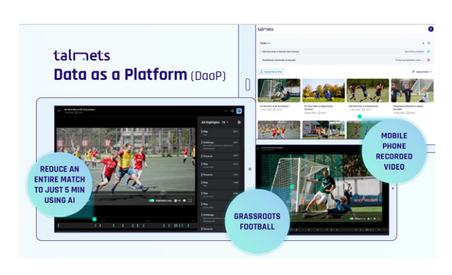
Product of Talnets from Switzerland

Talnets is a company focused on football talent intelligent identification technology. With data as the platform, using AI imaging analysis technology, Talnets can easily compress the infor-