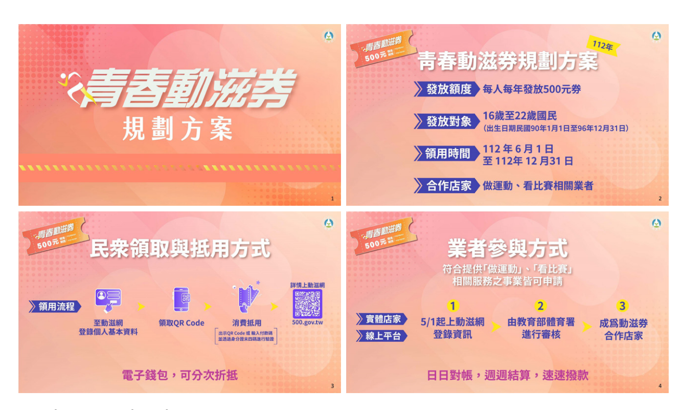
► Youth Sports Vouchers plan

The Sports Administration will actively continue to invite sports operators to become cooperating stores and to provide additional schemes to increase the number of people participating in sports. To provide people with convenient and diverse redemption channels and taking into account operator need, an API connected online redemption function will be provided to allow people to spend their vouchers online.