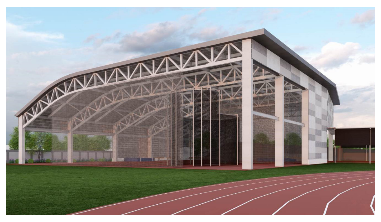
▶ Simulation diagram of the all-weather throwing field at the National Sports Training Center

In the past, athletics training has all been conducted outdoors, including shot, discus, hammer, high-jump, pole-vault, and javelin. The Sports Administration has planned an all-weather throwing field for the south side of the National Sports Training Center's all-weather track to provide athletes with a training venue for 365 days a year, to give them a better environment for competitive sports training.