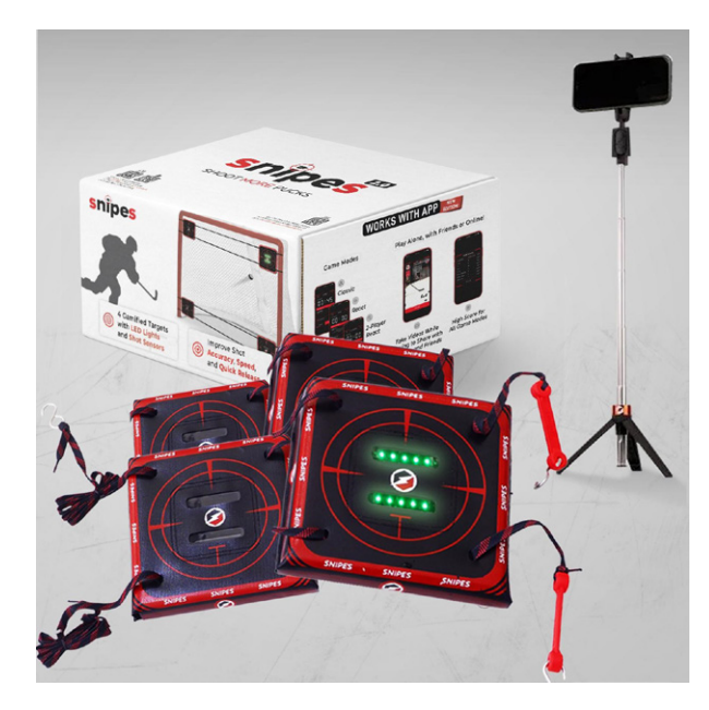
▶ Product of Bolt Sports Co. from Canada

analysis, as well as adding an element of fun to make training more diverse.