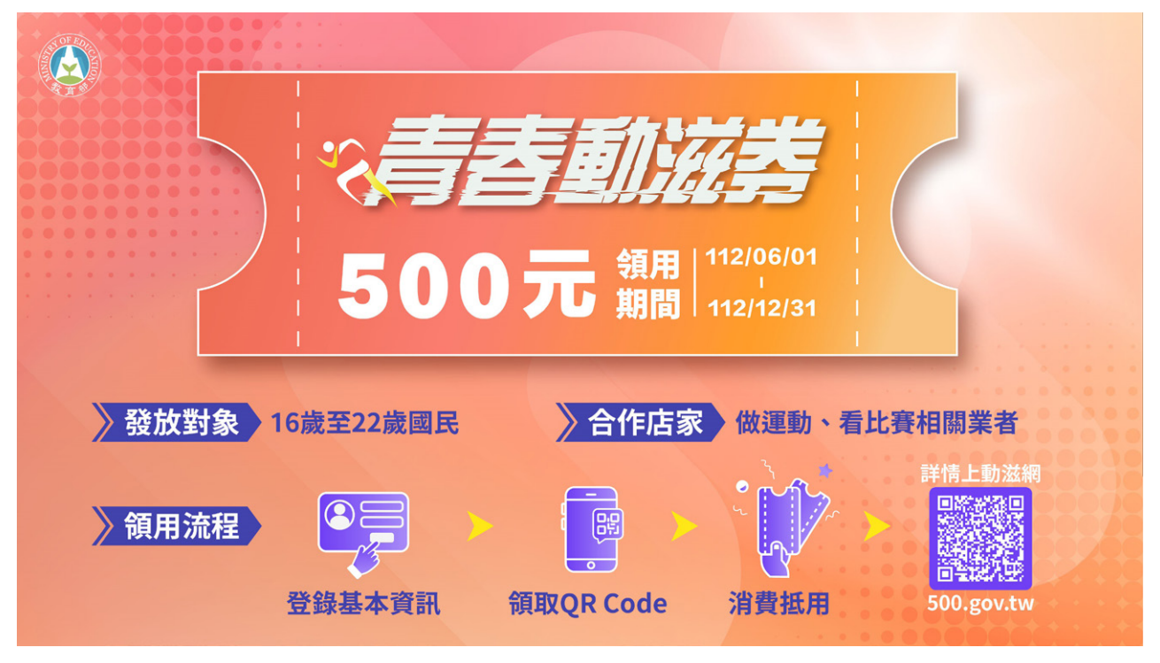
► Explanation of Youth Sports Vouchers

To extend the effects of the Sports Voucher and encourage young people to actively take part in sports events or spectate to let sports become fond memories of youth, the Ministry of Education plans to annually issue NT$500 Youth Sports Vouchers to around 1.65 million citizens aged 16 to 22.