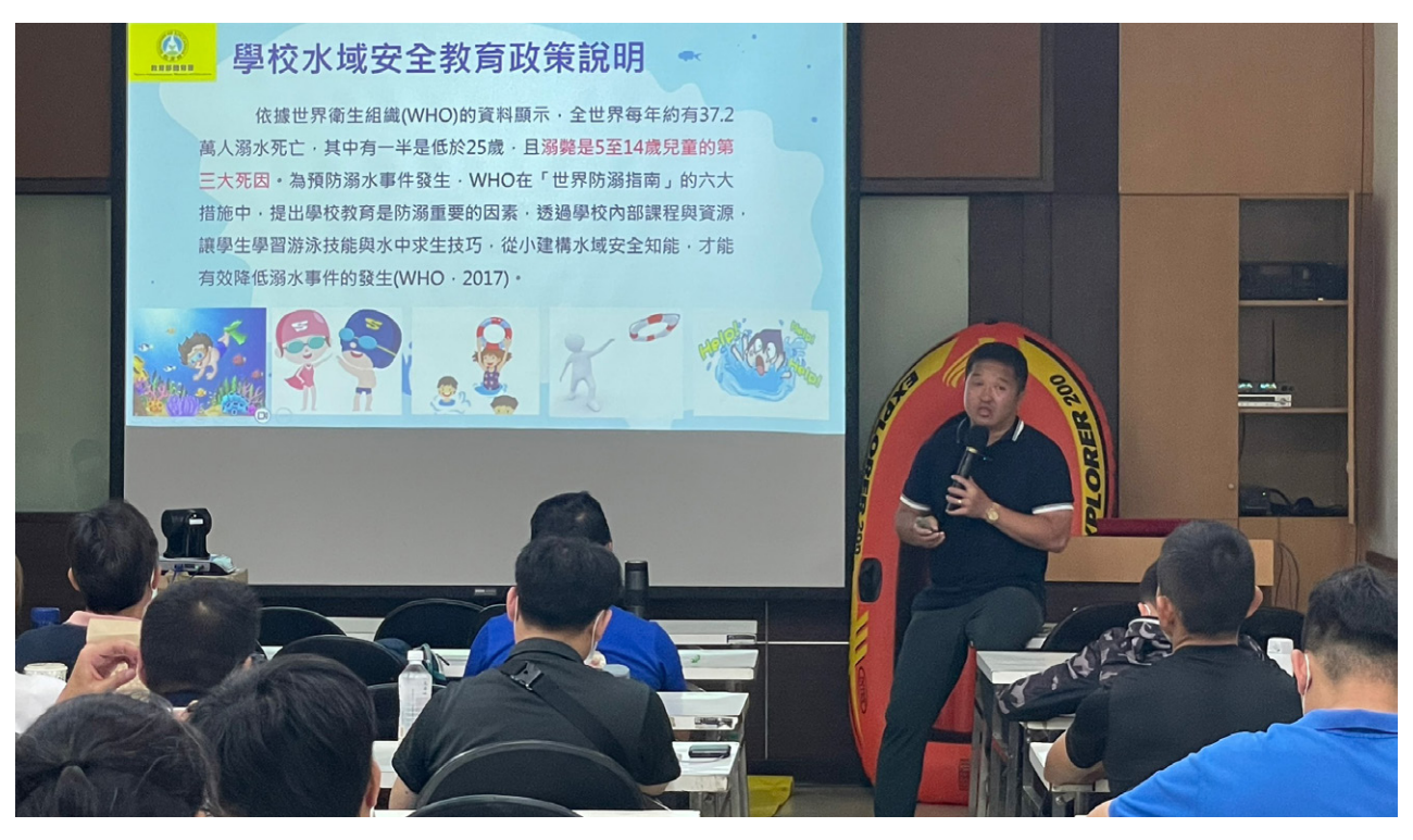
> 2023 Seminar for promotion of integrated swimming resources and enhancing swimming and self-rescue teaching

The Sports Administration Held the 2023 Seminar for Promotion of Integrated Swimming Resources and Enhancing Swimming and Self-Rescue Teaching to Improve Swimming and Self-Rescue Teaching Competencies.