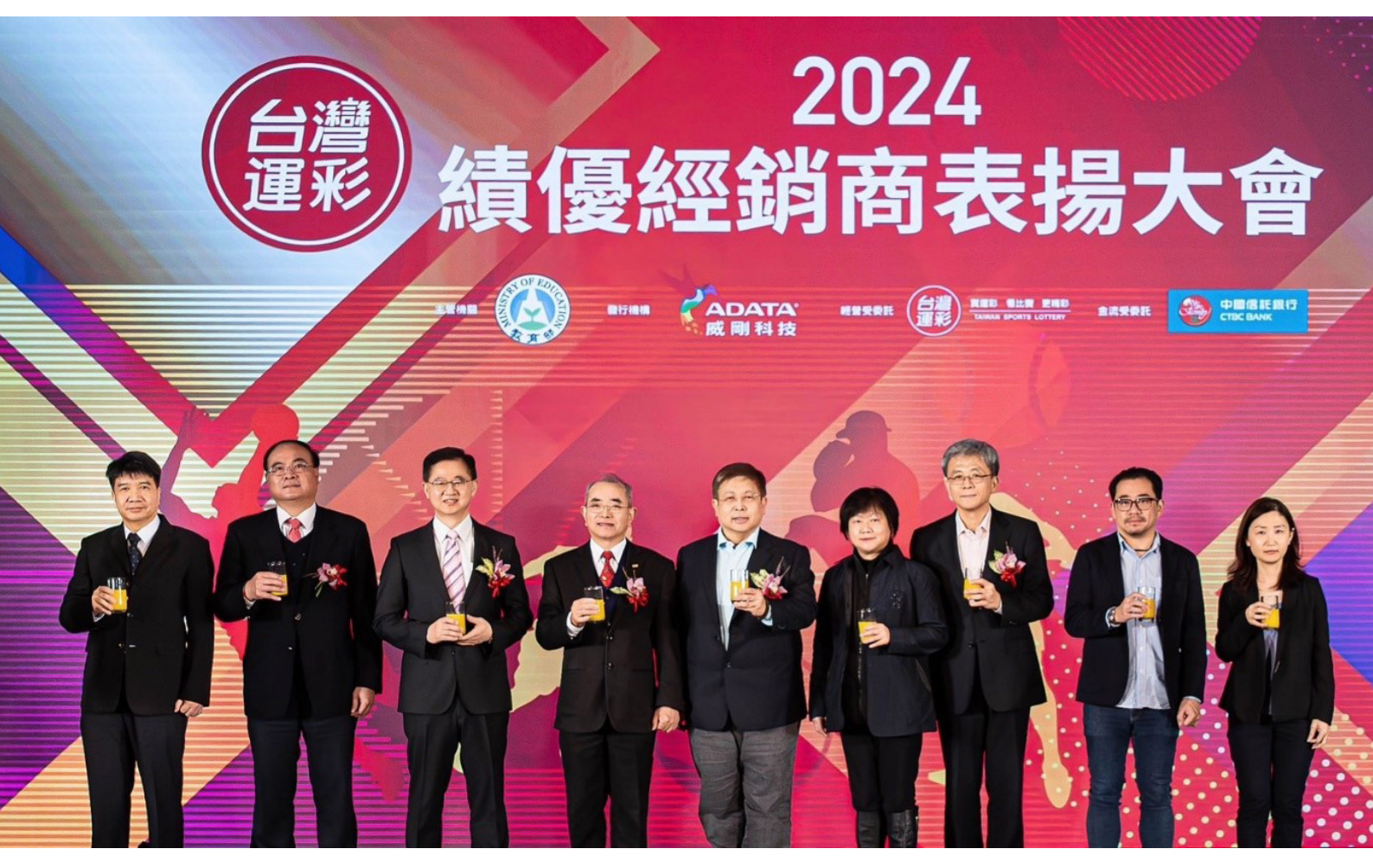
▶ The surplus from the Sports Lottery is one of the main sources of funding for the development of sports in Taiwan

In its third year (2024), Taiwan's Sports Lottery reached a new sales record of NT$64.3 billion, driven by the introduction of new betting sports, expanded play options, and major international events such as the UEFA European Championship, the Olympics, and the World Baseball Classic. Over NT$7 billion was allocated to the National Sports Development Fund.